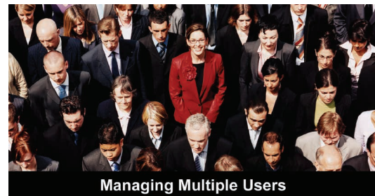
Managing Multiple Users